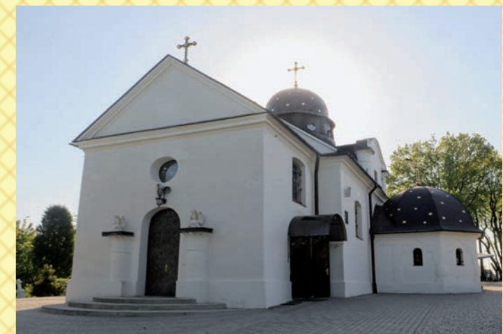
A parochial Dormition of the Virgin Mary Church was built in 1795 and reconstructed in a rare modern style in 1927.